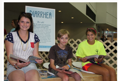
Left & above: Youth stop at the Clinic to learn about water-related illnesses, such as malaria and diarrhea.