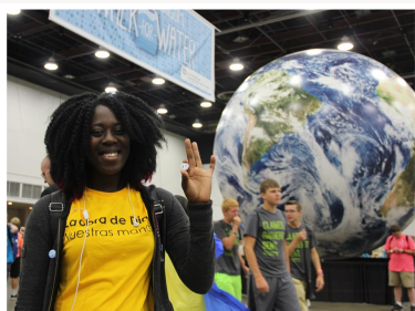
Above: Showing off a 3.7 button after walking 37 laps, equal to 3.7 miles, with a jerry can.

See more pictures and stories from the event online.