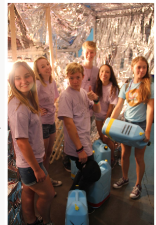
Below: Stopping in the "heat tent" along the track.

The Walk for Water isn't over yet! Our efforts to support water-related projects continue through the end of 2015. Bring the Walk for Water track experience home to your congregation with our Do-It-Yourself brochure, available for download online . The Rise Up Together Tour will also be supporting ELCA World Hunger's Walk for Water. See page 3 of Go and Do News to learn about the tour.